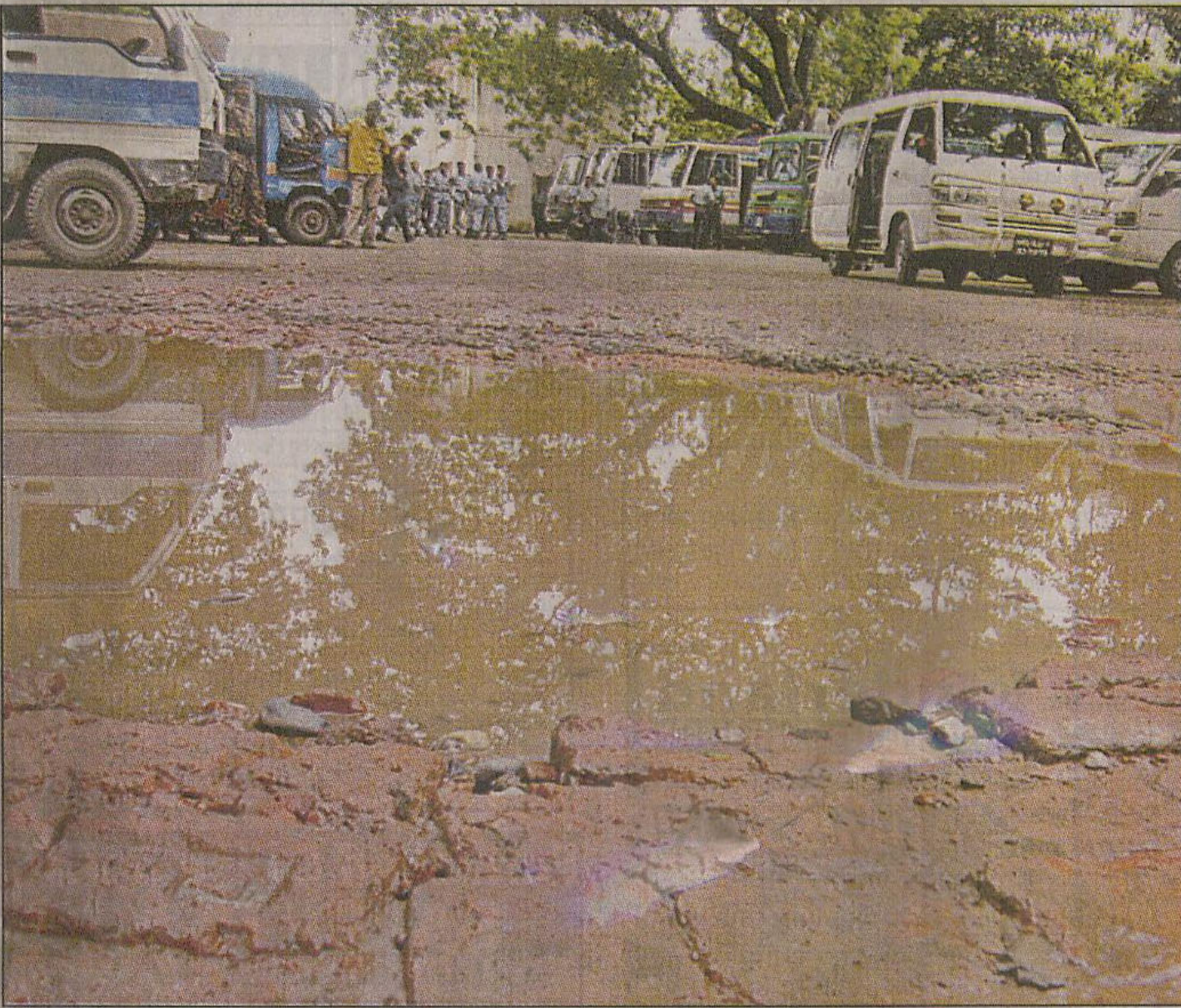
The road in front of the police control room at Shahbagh in the city has long been in a very bad shape, but the authorities remain indifferent.