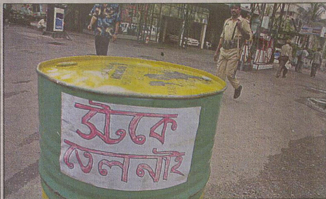
The fuel station near the Matsya Bhaban in the capital remains closed with display of the words "no oil in stock" during yesterday's strike called by a faction of the petrol pump owners association.