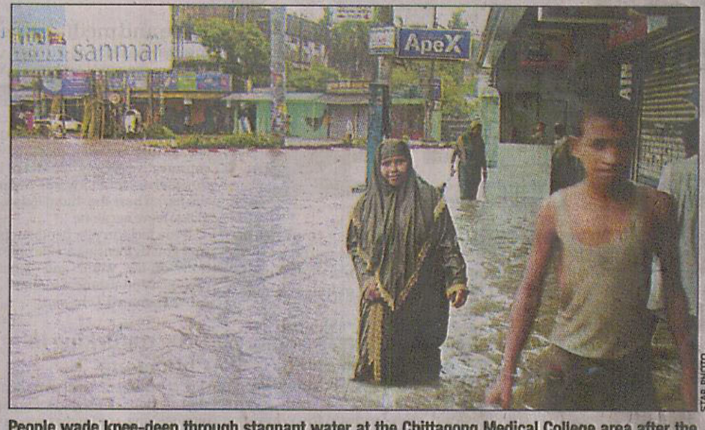
People wade knee-deep through stagnant water at the Chittagong Medical College area after the downpour inundated half of the city on Saturday.