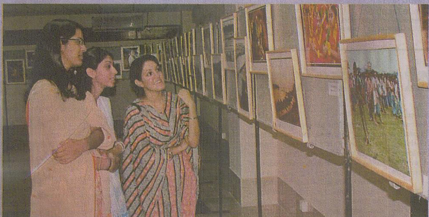
Visitors at the three-day photo exhibition at Chittagong Press Club auditorium on Saturday. Chittagong Photojournalists' Association organised the event.