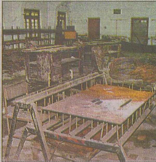
Chittagong Polytechnic Institute, top, a wretched wall with cracks, bottom left, and an abandoned workshop, right.