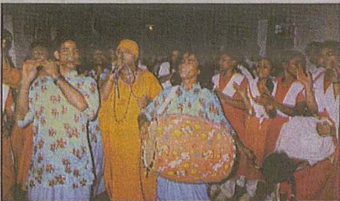
A baul performance at a local school

A yearlong project undertaken by the Palli Baul Samaj Unnayan Sangstha (PBSUS) to introduce our traditional folk genre, legendary bards and instruments amongst the young generation, comes to an end this month. As part of the programme PBSUS selected different schools all across the country, says a press release.