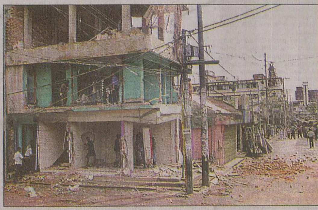
Workers of Chittagong Development Authority demolish illegally constructed buildings in the city's Chawkbazar area yesterday.