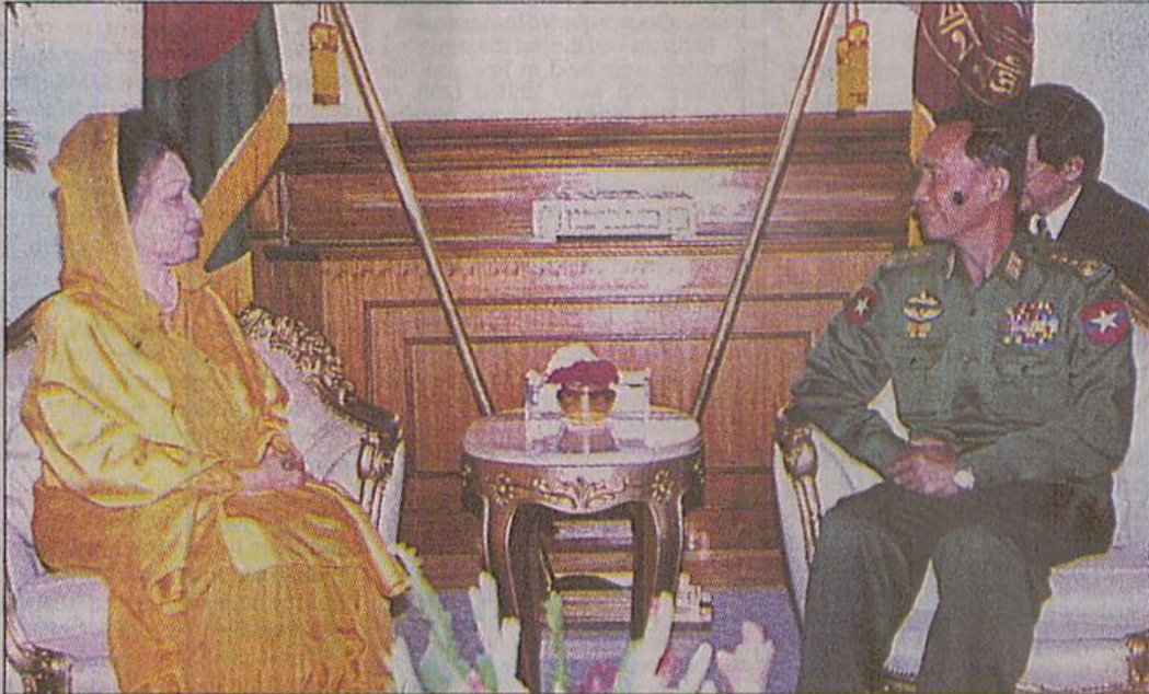
Myanmar Chief of General Staff and member of the State Peace Development Council General Thura Shwe Mann calls on Prime Minister Khaleda Zia at her office yesterday.

Saifur urges expats UNB, Dhaka Finance Minister M Saifur Rahman has called upon the expatriate Bangladeshi community to project the country's positive image abroad by manifesting the nation's achievements and countering the negative campaigns mounted against it. The minister said this while addressing Bangladeshi professionals living in Washington at a discussion at the Bangladesh embassy on the sidelines of the Plenary Session of the 2005 Bank-Fund Annual Meetings on Saturday. The theme of the discussion was 'Recent Economic Developments and Issues in Economic Policy,' according to a message received from the embassy. The minister, also the governor of Bangladesh for the World Bank and International Monetary Fund (IMF), highlighted the progress made by Bangladesh in economic, social, health, education, poverty alleviation, and human resources sectors. Bangladesh's achievements in all these sectors are quite impressive compared to many developing countries, he added.