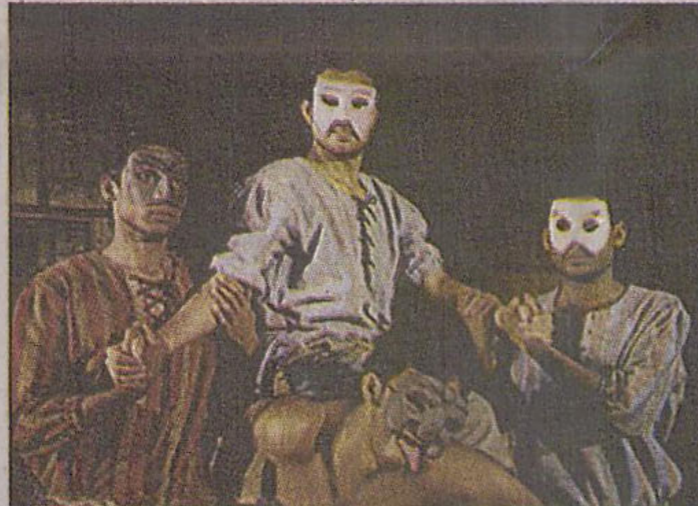
Actors in the play The Mission