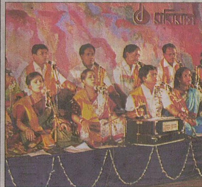
Artists of Rabiraag performing a chorus