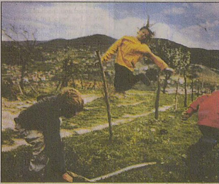
One of Ziyu Gafic's works

The project, Tales from a Globalising World is an initiative launched in 2002 by the Swiss Agency for Development and Cooperation (SDC). As part of the Swiss Ministry of Foreign Affairs, SDC focuses on humanitarian aid and cooperation of developing countries.