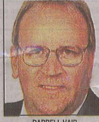
DARRELL HAIR crows. The Sri Lankan is second to Australian Shane Warne (623) with 563 Test wickets and only returned