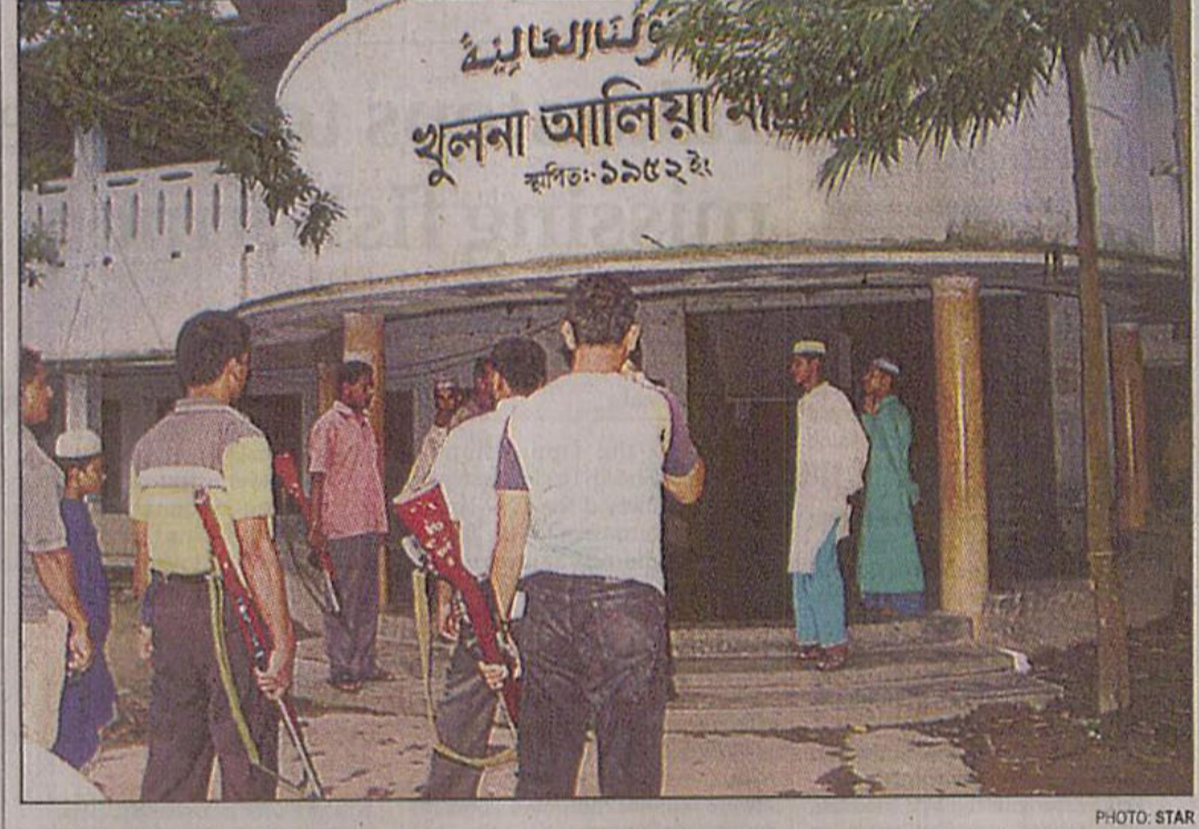
District Detective Branch of police conducts a raid on Khulna Alia Madrasa yesterday in search of militants suspected to be involved in August 17 bomb blasts.