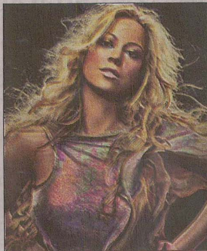
Compiled by Cultural Correspondent

However, success is not an unfamiliar phenomenon to Mariah. She was the best-selling female artist of the 1990s through best-selling albums like Music Box , Daydream , Butterfly and Rainbow . She rose to superstardom on the strength of her stunning five-octave voice; she moved to effortlessly from glossy ballads to hip-hop numbers she earned frequent comparison to rivals Whitney Houston and Celine Dion, but did them both one better by composing all of her own material. According to Columbia Records and Universal Music, Carey has sold a total of 150 million records worldwide.