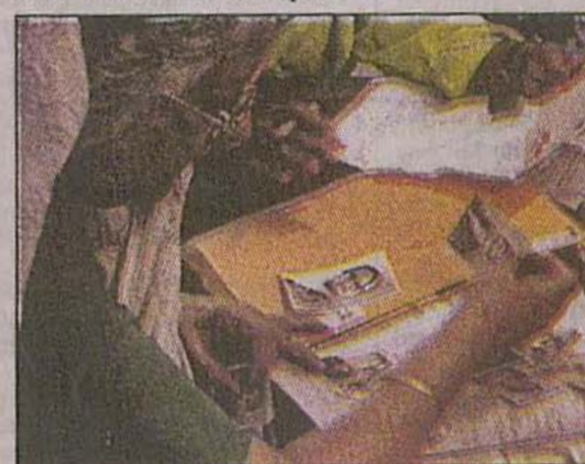
Scenes from Begum and Depannita: A Lady with Versatile Talents

increase their participation in AV, particularly in the fields of direction, camera work and editing. The second aim was to capture a