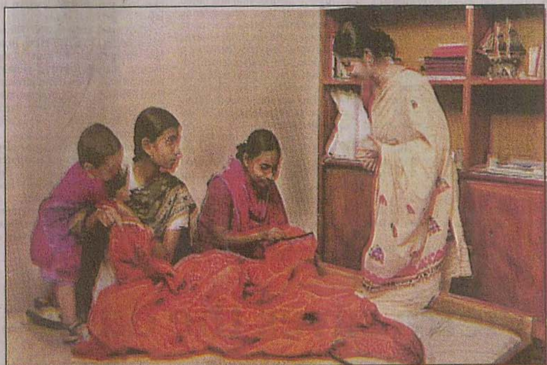
A scene from Motherhood: Women's Perspective

Six documentary films that support the cause of women