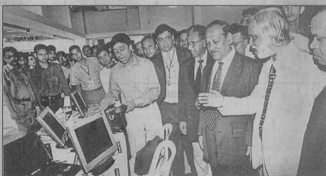
Abdul Mannan Bhuiyan, LGRD & cooperatives minister, Abdul Moyeen Khan, science and ICT minister, and Md Aminul Haque, post & telecommunications minister, visit a stall in the six-day BCS Computer Show 2005 that began in Dhaka yesterday.