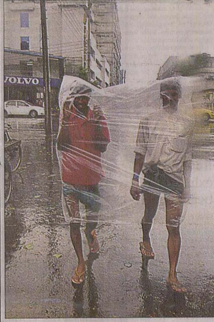
Pedestrians wrapped in polythene walk the streets braving the rain in Tejgaon in the city yesterday.