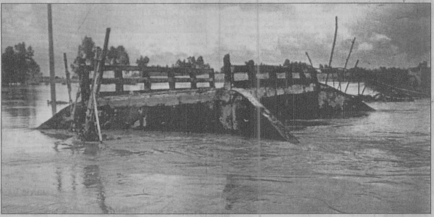
Floodwater has washed away the Chilgacha kutchra road in Kazipur upazila in Sirajganj district.

When contacted, RU JCD convener Nuruzzaman Likon claimed that appointments were made 'absolutely on the basis of merit'.