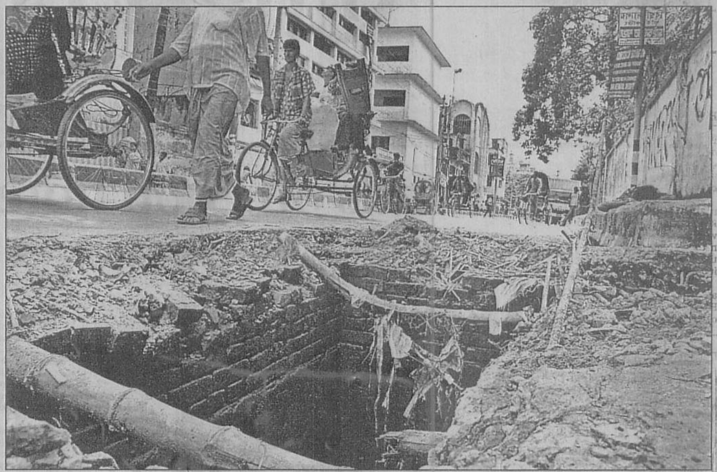
The cover of a manhole near the Nabakumar School at Bakshibazar in the city caved in about a month ago, but the authorities remain indifferent to the suffering of the pedestrians as well as passengers.