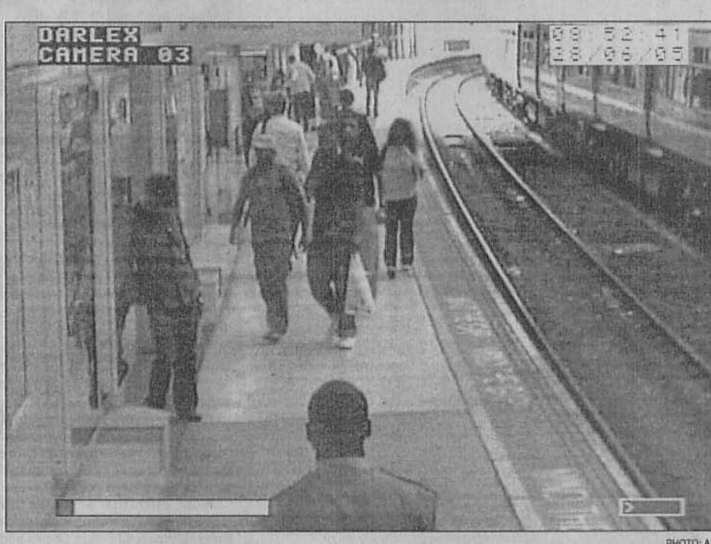
This handout picture given by London Metropolitan Police shows a grab image taken from a CCTV footage dated June 28, 2005 showing (Centre from L-R) Mohammed Sidique Khan, Germaine Lindsay and Shahzad Tanweer, three of four presumed London suicide bombers arriving at King's Cross Thameslink station during an apparent dummy run of their July 7 attack.

in return for aid and recognizing its right to a civilian nuclear programme. The six agreed to discuss providing a light-water reactor "at an appropriate time." Analysts noted the North had backtracked on seemingly rock-solid positions before, and so the deal was not dead yet.