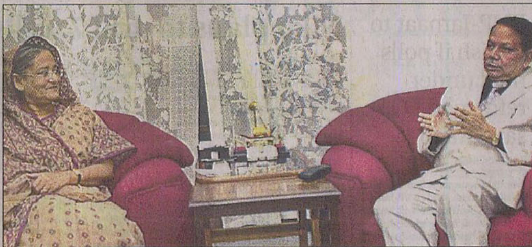
Indian Water Resources Minister Priya Ranjan Dasmunshi called on Awami League President Sheikh Hasina at her Sudha Sadan residence in the city on Monday.

Fifty-six photographs of 14 photojournalists of local and national newspapers will be put on display. The exhibition will remain open for all from 10:00am to 8:00pm everyday.