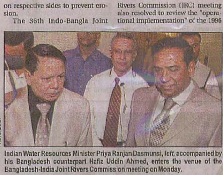
Indian Water Resources Minister Priya Ranjan Dasmunsi, left, accompanied by his Bangladesh counterpart Hafiz Uddin Ahmed, enters the venue of the Bangladesh-India Joint Rivers Commission meeting on Monday.

STAFF CORRESPONDENT The two-day Indo-Bangla water talks concluded in the city yesterday with no major breakthrough in sharing of Teesta water and India assuring Bangladesh of no water diversion from the Ganges and Brahmaputra under its multibillion river linking project (RLP). Both Bangladesh and India agreed on a joint inspection by their water ministers of the bordering areas affected by erosion of transboundary rivers after Eid-ul-Fitr, the water resources ministers of the two countries Priya Ranjan Dasmunsi and Hafiz Uddin Ahmed told journalists after the meeting. After examining the ground realities, both the countries will start re-vent work from January 2006