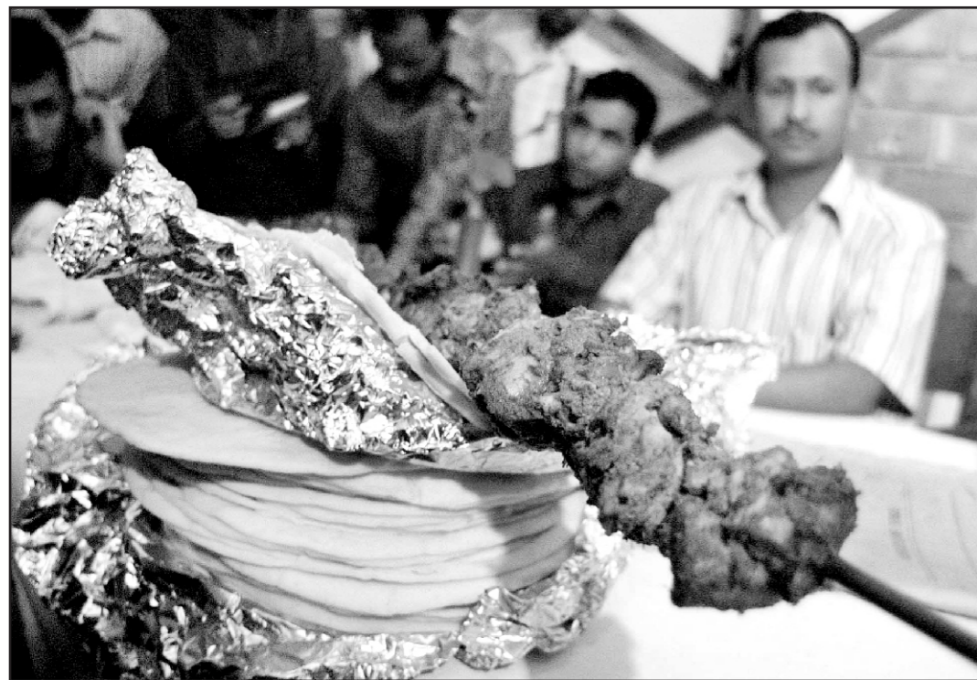
A mobile court team found stale pieces of bread and pieces of meat prepared unhygienically at a restaurant, Topkapi, during a drive against food adulteration at Gulshan in the city yesterday.

Local people, relatives, friends and admirers have been requested to attend the programmes.