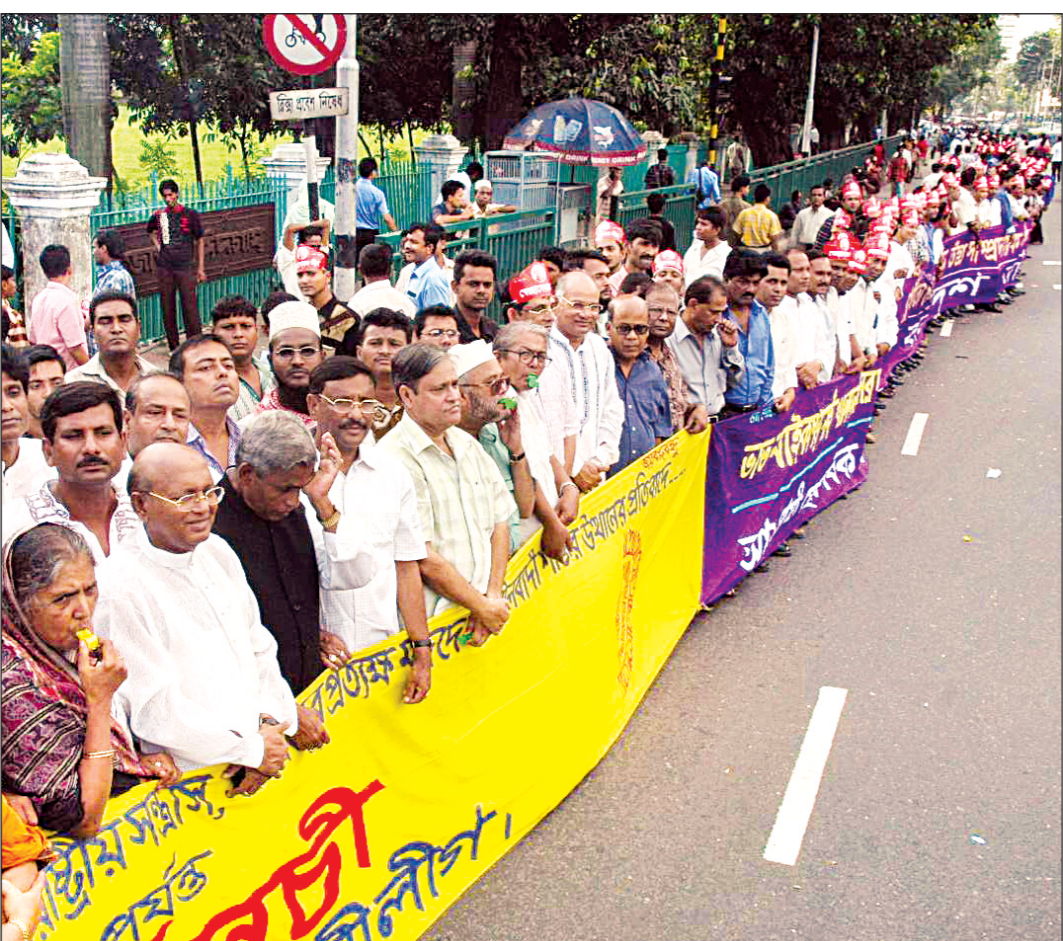
Main opposition Awami League leaders and activists form a human chain in the capital yesterday protesting the August 17 countrywide bomb attacks.

STAFF CORRESPONDENT The main opposition Awami League (AL) and its front organisations yesterday formed an eight-kilometre long human chain in the city in protest against price hike of fuel and essentials and countrywide serial bomb blasts on August 17.