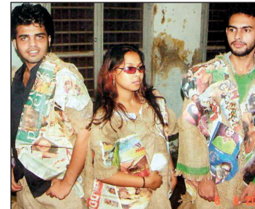
Performers in the play Shampritir Shandhaney

"Street play is a vital art form endemic to the cultural fabric and traditional rituals of people worldwide. It is immediate, intimate and interactive. The Kochi Sriti