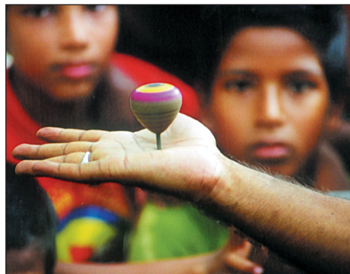
Khurshid's use of the golden rule of thirds