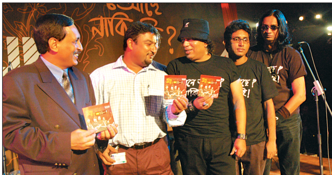
(L-R) Director of Finance (GP), Director of Marketing (GP), Bachchu along with other members of LRB at the

Ayub Bachchu, the vocalist and lead guitarist of the band, said, "I cannot thank LRB rooters enough for their support over the years. LRB has always tried to stay true in delineating youth concerns. With time, the style and genre of our songs have gone through changes from hard rock to soft. We've been