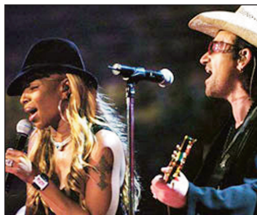
Mary J Blige and Bono performing at the programme

"We've all heard the question," actor/comedian Chris Rock said. "Why didn't these people just leave when they had the chance? But now we realise that not everybody can just jump into their SUVs and drive to a nice hotel. These people depend on public transportation, and these