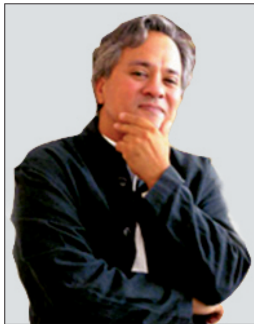
(Top) Anish Kapoor (bottom) A view of Marsyas

The film attracted a wide variety of people--ranging from artists, sculptors, students to teachers and