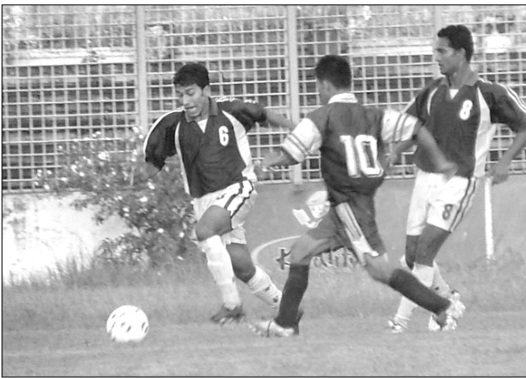
Action from yesterday's CJKS-Elite Paint First Division Football League encounter between Shatadal Club and Rising Star at the MA Aziz Stadium.

Today's matches: Madarbari Udoyan vs Muktiyodha Sangsad (1:30pm) and Abahani Junior vs Brother Union (3:00pm).