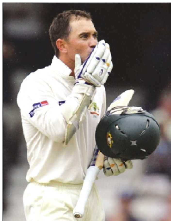
CENTURY NUMBER 22ND: Australia opener Justin Langer blows a kiss to the crowd upon reaching his hundred at The Oval on Saturday.