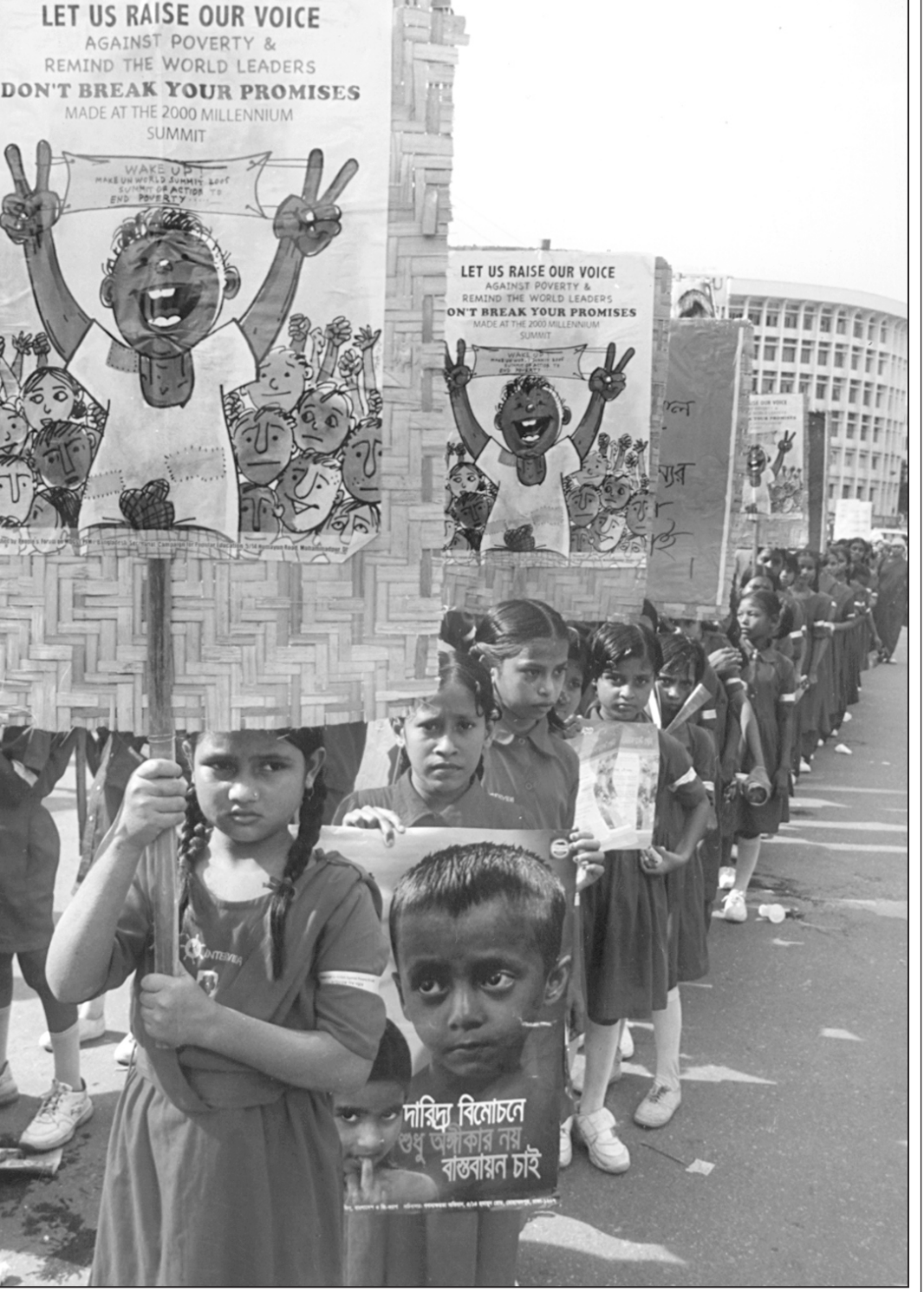
People's Forum on the Millennium Development Goals Bangladesh took out a procession in front of the National Museum in the city yesterday marking the Second World White Band Day.

Dhaka at the age of 52. She is survived by her husband