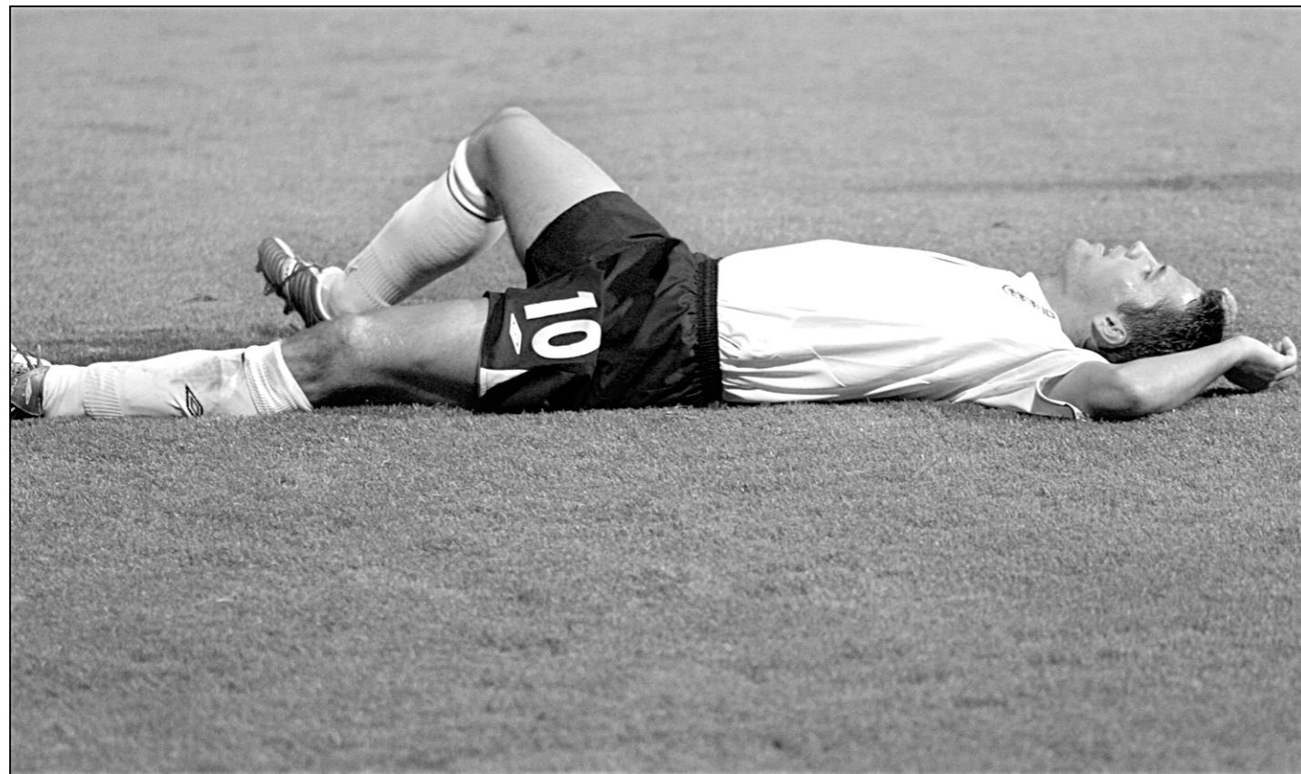
Michael Owen's body language tells the story after England were shocked by Northern Ireland at Windsor Park in Belfast on September 7.