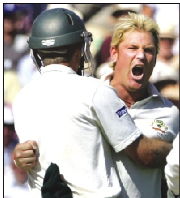
ONE MAN SHOW: Australia spin wizard Shane Warne (R), who took all four England wickets until tea, shouts for joy after he bowled Kevin Pietersen on the first day of the final Ashes Test at The Oval on Thursday.