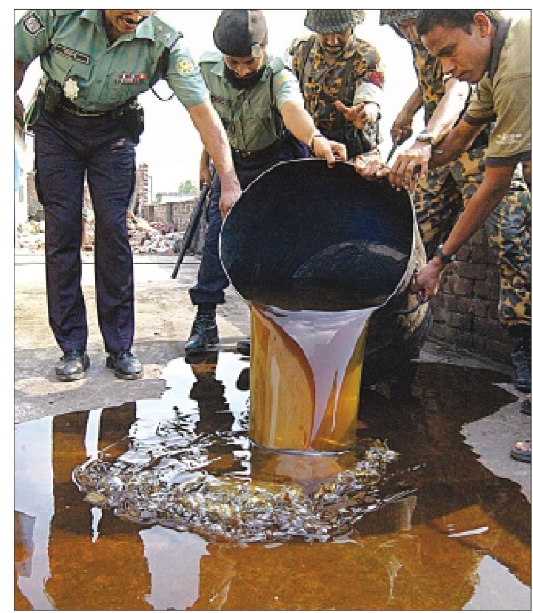
Members of a mobile court drain used lubricant out of a drum seized during a raid on a food factory in Postogola in the capital yesterday.