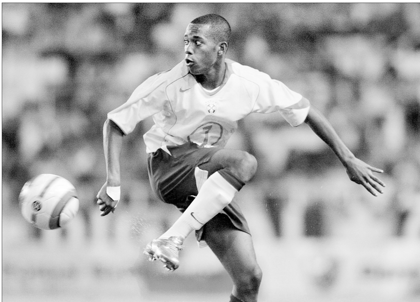
Brazil star Robinho receiving the ball during their friendly against Sevilla at the Sanchez Pizjuan stadium in Seville on Tuesday.

Brazil coach Carlos Alberto Parreira made eight changes at the start of the second half including former Sevilla forward Julio Baptista, who became another Madrid signing this summer.