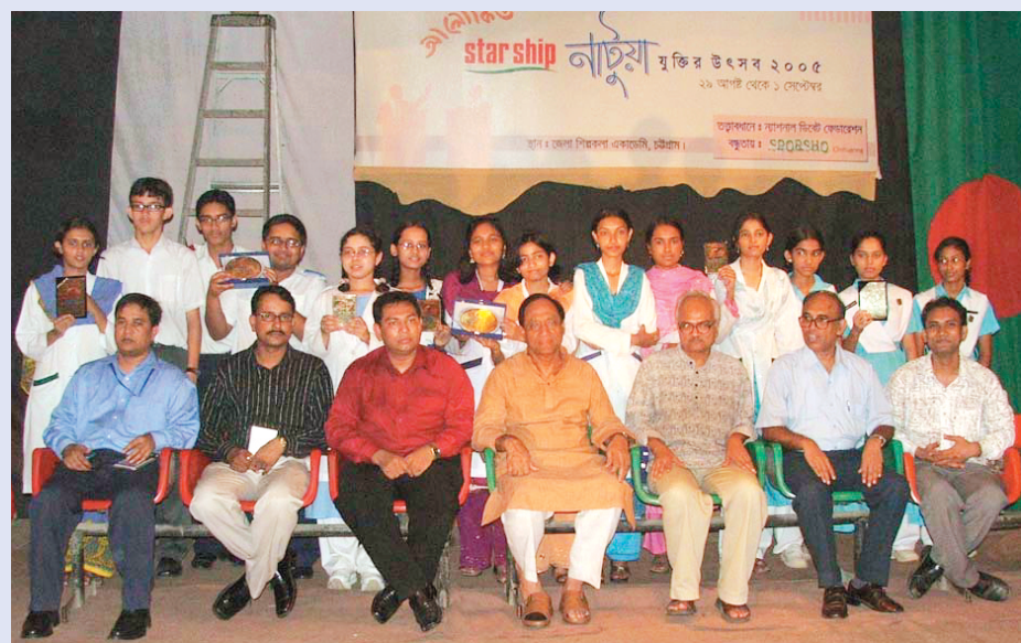
Winners of the Prothom Alo Alokito-Star Ship-Natua Juktir Utsab 2005, a debate competition, pose for a photograph with the guests at the concluding ceremony at the Chittagong Shilpakala Academy auditorium on Thursday.