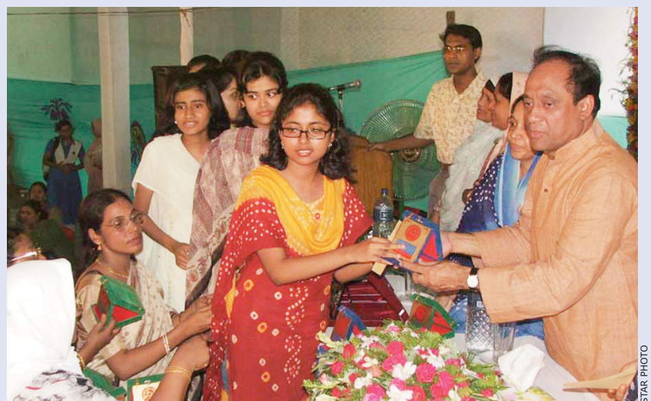
The GPA-5 achievers of Dr Khastagir Govt Girls High School receive crests from Fisheries and Livestock Minister Abdullah Al Noman at a ceremony on the school premises on Thursday.