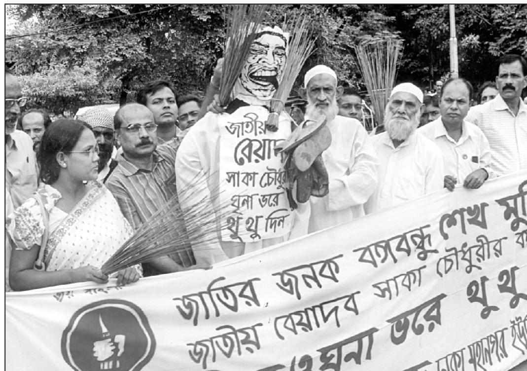
Muktijodha Sangsad took out a broom stick procession at Muktangan in the city yesterday protesting derogatory remark on Bangabandhu made by Prime Minister's Parliamentary Affairs Adviser Salauddin Quader Chowdhury.

Amidst such conflicting and confusing statements by the prime minister and her cabinet colleagues, investigation cannot be impartial and credible, he added.