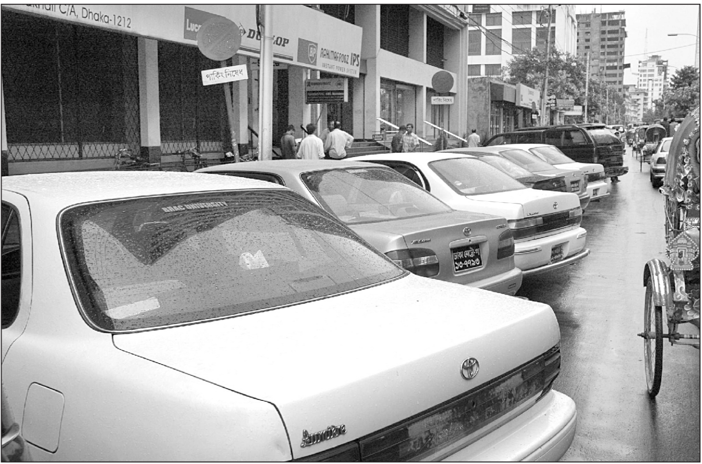
Cars remain parked along a road at Mahakhali in the city yesterday although a sign nearby reads 'No Parking'. Such parking of vehicles often leads to traffic congestion in the area.