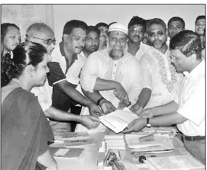
Consumers' Rights Protection Committee submits a memorandum to the Deputy Director of Bangladesh Standard and Testing Institution in Chittagong yesterday, calling to intensify drive against food adulteration.

Police showed the body to local people but nobody recognised him. Later, police sent the body to Mitford morgue for autopsy.