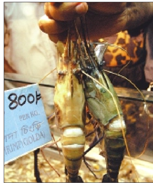
Stale fish and prawn seized by a mobile court during a raid on Agora superstore at Rifles Square in the capital yesterday.