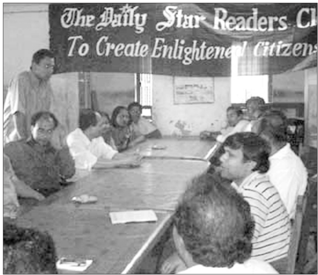
The Daily Star Readers Club arranged a discussion meeting at Gopalaganj Bar Council conference room recently. Teachers, lawyers doctors, journalists, students and the elite of the town attended the meet.