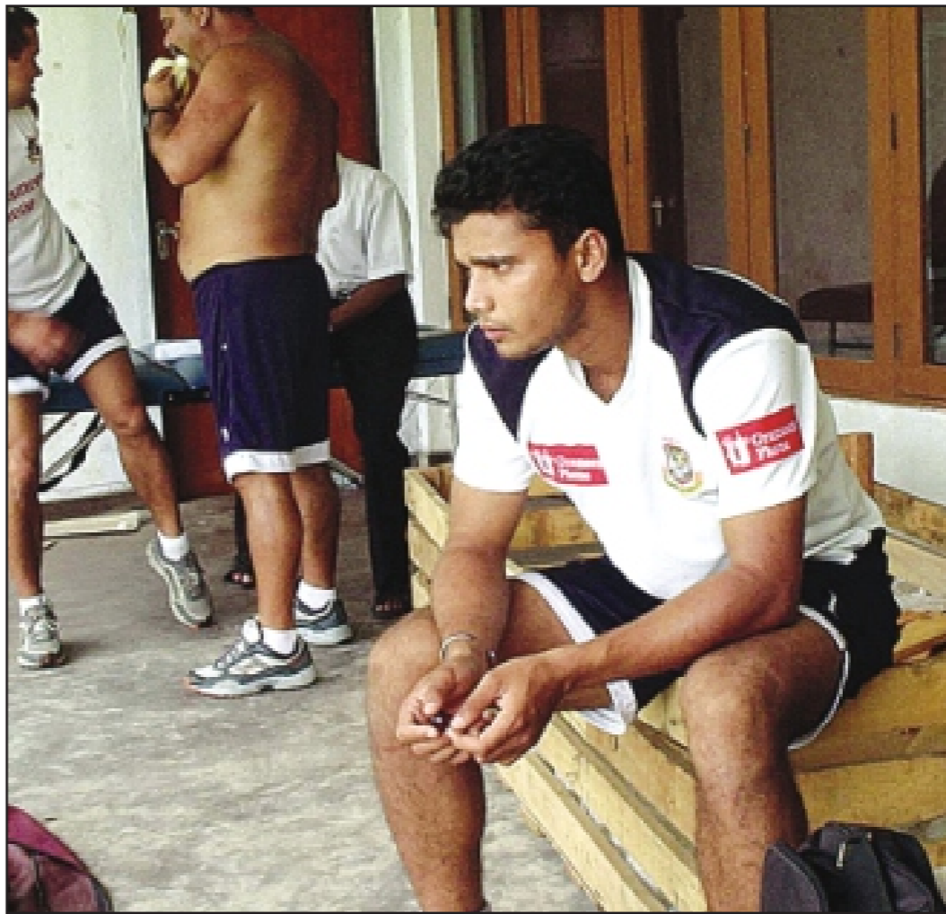
NO STRANGER TO TIMES LIKE THESE! Injured Bangladesh fast bowler Mashrafee bin Mortuza sits alone at a corner of the Nondescript Cricket Ground in Colombo while watching his mates train on the field on Thursday.