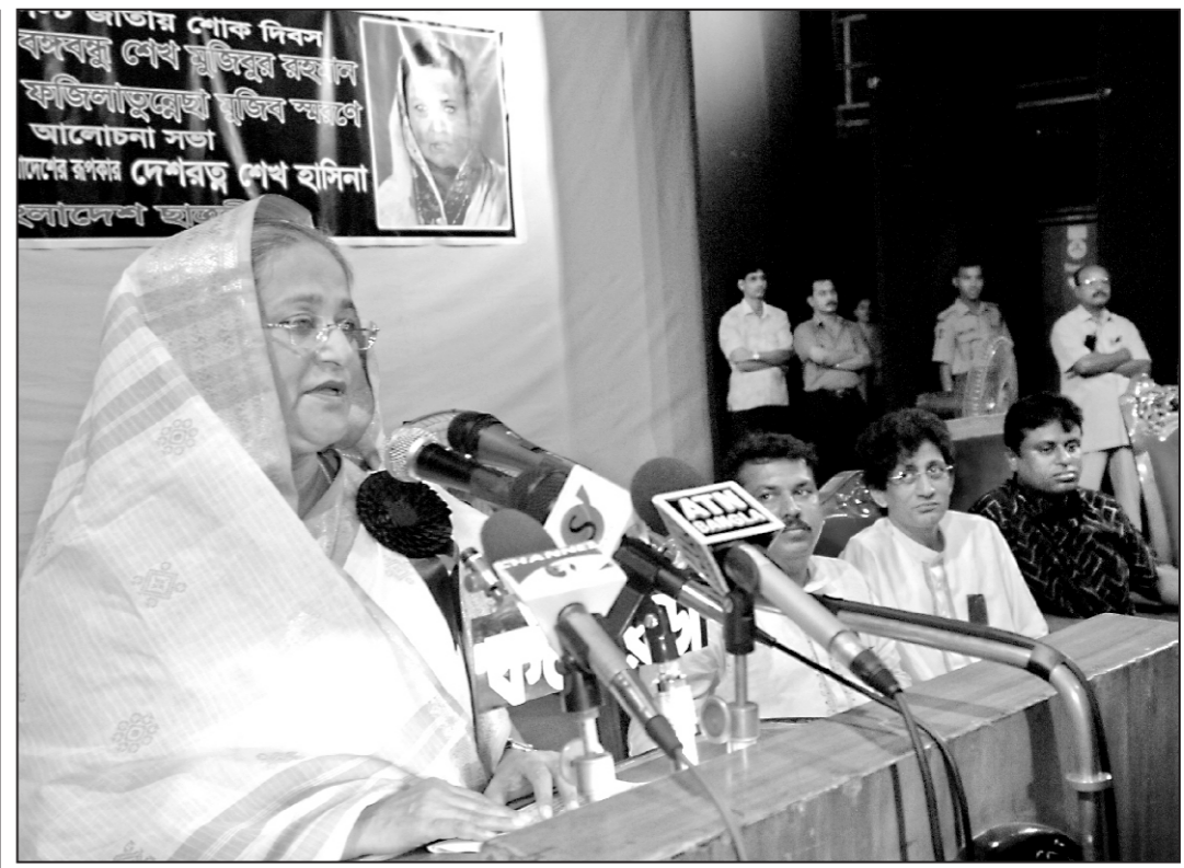
Awami League President Sheikh Hasina speaks at a discussion on the occasion of the National Mourning Day at the Institution of Engineers auditorium in the city yesterday. Bangladesh Chhatra League organised the meeting.

In the finals, Chittagong Public School and College beat Chittagong Government Girls High School in the school group participated by 14 schools while Haji Mohammed Mohsin College defeated Chittagong College in the college group where 8 colleges took part.