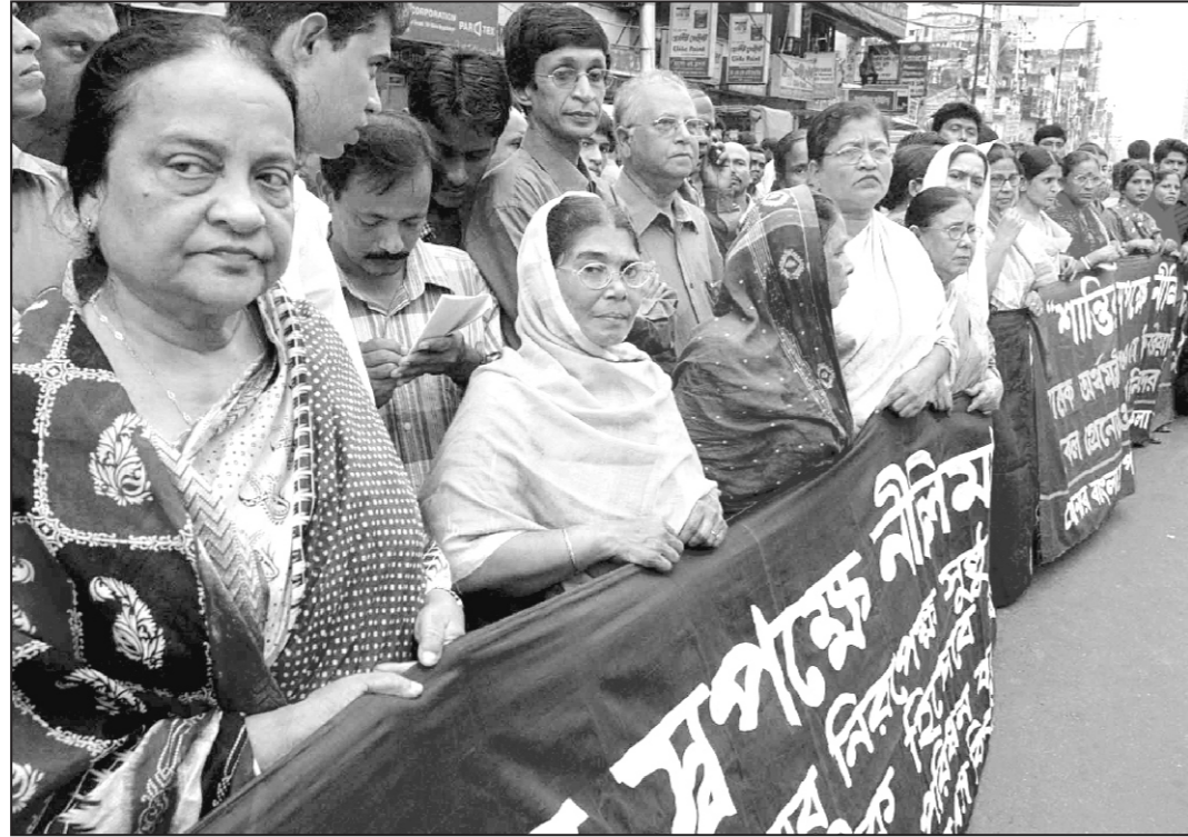
Family members of slain former finance minister Shah AMS Kibria and members of the civil society line up on the Tongi Diversion Road at Moghbazar in the city yesterday as part of 'Blue for Peace' programme, demanding trial of the killers of Kibria.