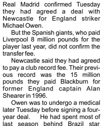
MICHAEL OWEN "Bringing Michael to St James Park will rank alongside the signing of Alan Shearer as my proudest moment at Newcastle United," chairman Freddy Shepherd said.

Football AFP, Madrid Real Madrid confirmed Tuesday they had agreed a deal with Newcastle for England striker Michael Owen. But the Spanish giants, who paid Liverpool 8 million pounds for the player last year, did not confirm the transfer fee. Newcastle said they had agreed to pay a club record fee. Their previous record was the 15 million pounds they paid Blackburn for former England captain Alan Shearer in 1996. Owen was to undergo a medical later Tuesday before signing a four-year deal. He had spent most of last season behind Brazil star Ronaldo and club captain Raul in the Madrid pecking order and was pushed further down when Madrid signed Brazil pair Robinho and Julio Baptista in the summer.