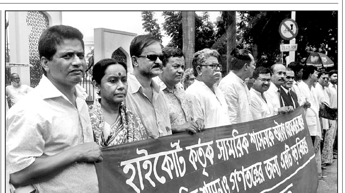
Jatiya Samajtantrik Dal (JSD) forms a human chain in front of the High Court in the city yesterday welcoming the High Court verdict on the Fifth Amendment to the constitution.