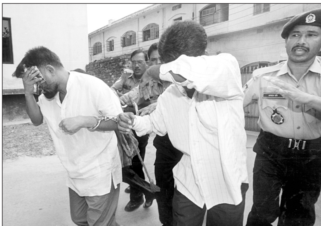
Two of four Rapid Action Battalion (Rab) members who were sentenced to five years' imprisonment for robbing a cattle trader of Tk 7.8 lakh were being taken to jail yesterday.