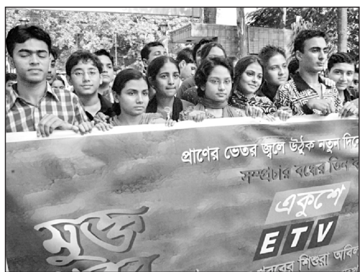
Children of Mukta Khabar, a programme of ETV, took out a procession in the city yesterday to mark the third anniversary of the closure of the transmission of the private TV channel.