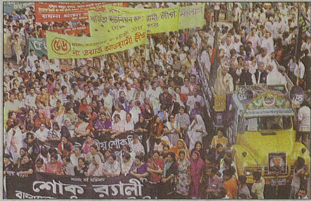
Leaders and activists of the main opposition Awami League march in a mourning procession in the city yesterday as part of the party's month-long programme to mark the 30th death anniversary of Bangabandhu.