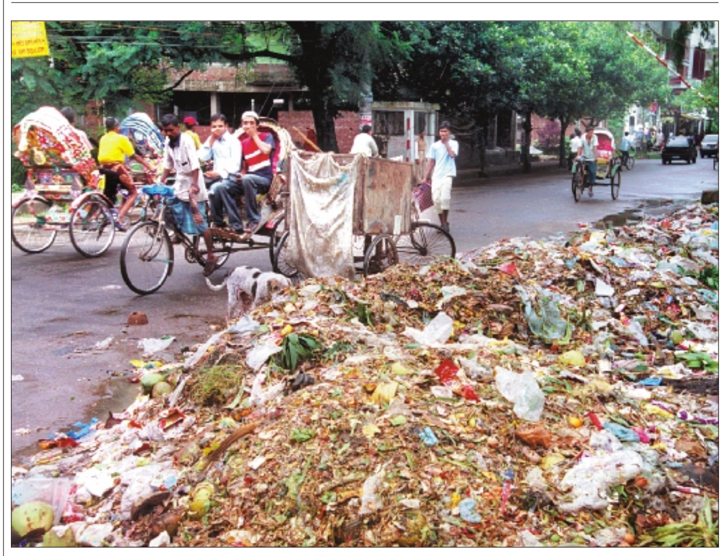
Piles of garbage remain scattered on the lakeside at Uttara Sector-5 in the city, emitting a stench and posing health hazards, but the authorities remain indifferent.

memorandums to the faculty dean and Vice Chancellor on August 30 and September 4 in this regard.