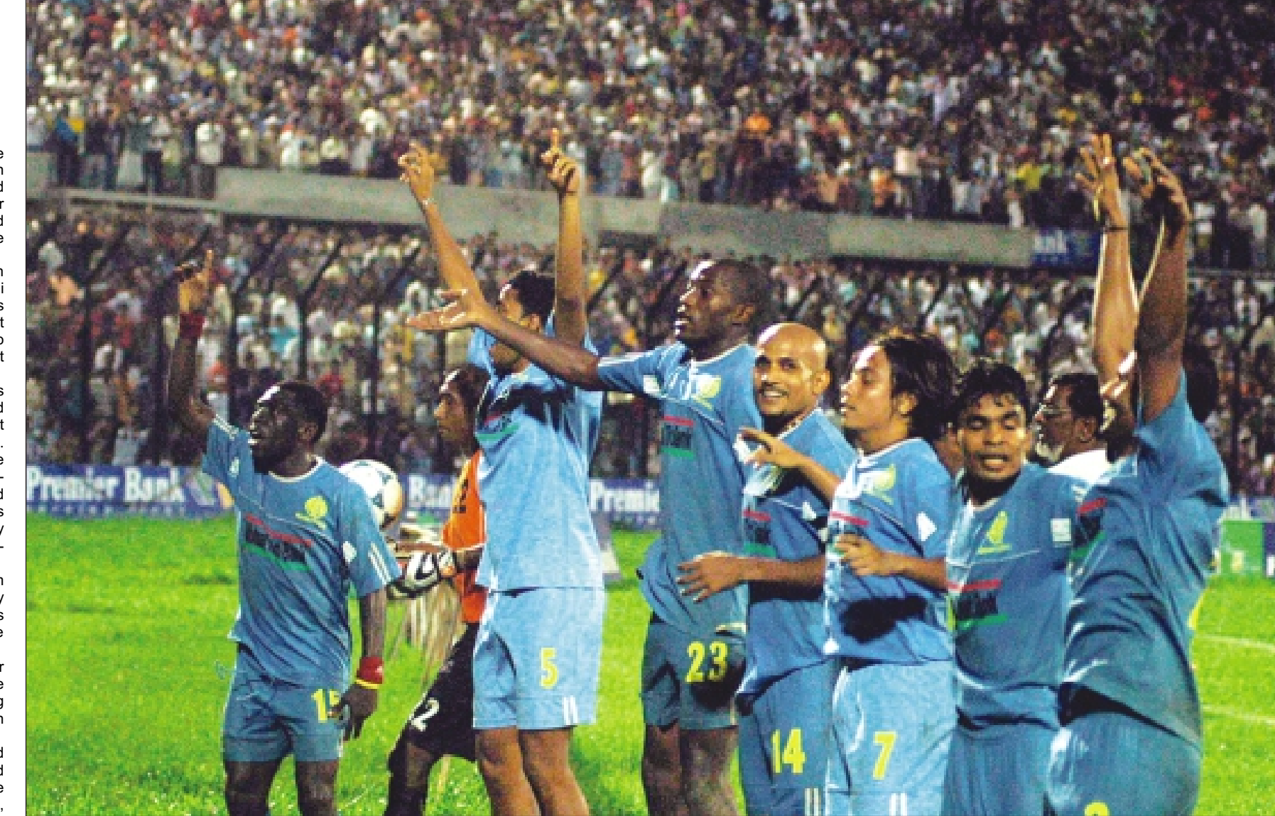
RELIVING NOSTALGIA: Ecstatic Abahani booters celebrate in front of an almost full house like in the good old days of domestic football, after their victory over Mohammedan Sporting Club at the Bangabandhu National Stadium on Friday.

Ibrahim picked up a deflected pass by Ndem outside the area and used all his power and skill to dribble three rival defenders -- Arman Aziz, Nazrul and Nigerian peter Odaf -before shooting a low left footer that SEE PAGE 13 COL 6