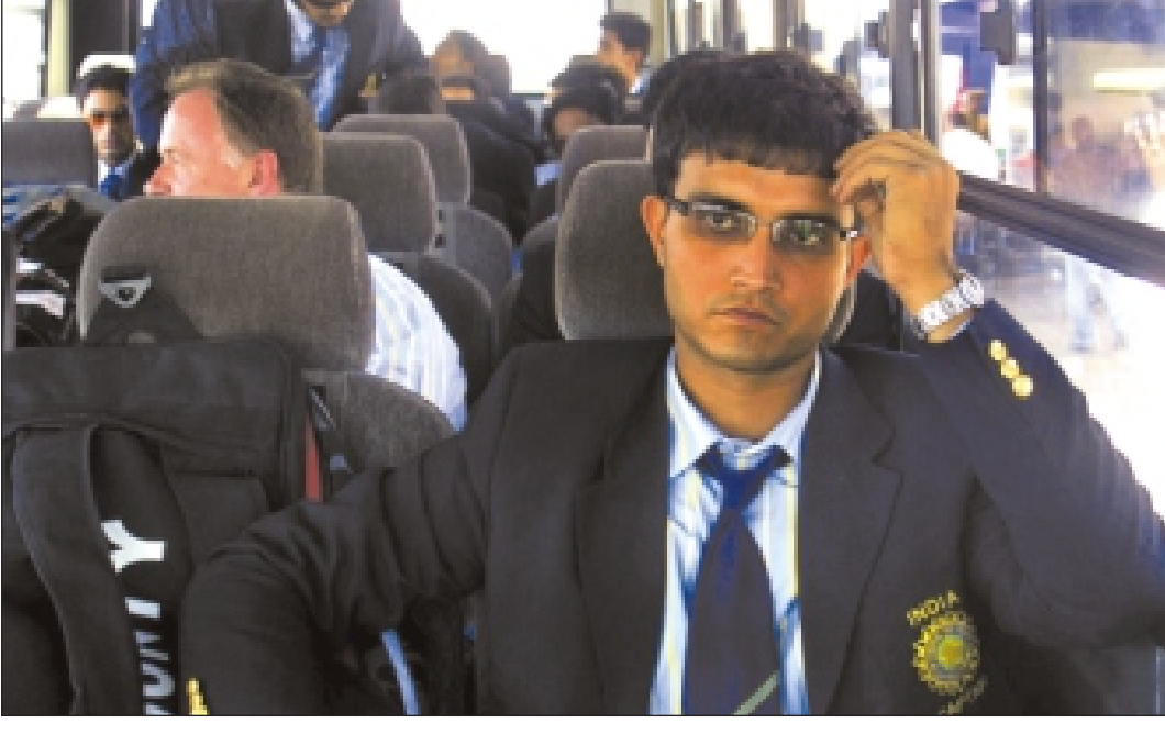
CAN I SCORE HEAVILY AGAIN? India cricket captain Sourav Ganguly, who is going through a lean patch, is engrossed in deep thinking while sitting in a bus with his teammates after their arrival in Harare on Tuesday. They will feature in a tri-series and the play two Tests against Zimbabwe.