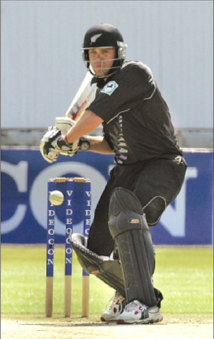
'VIOLENT' VINCENT: New Zealand opener Lou Vincent, who scored a stormy 172 off 120 balls, is all set to have a go at a Heath Streak delivery (not in picture) at Bulawayo on Wednesday.

In the 27th over, he smashed medium pacer Ireland high over mid-wicket for six to reach three figures and break New Zealand's one-day partnership record. Two balls later, Fleming drove a head-high catch to Heath Streak at extra cover, ending an aggressive 87-ball knock which included eight fours and four sixes. Vincent and Craig McMillan (47) brought up their century stand for the