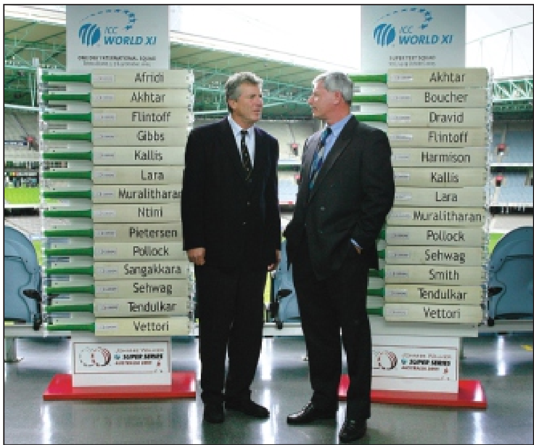
Selector of ICC World XI Richard Hadlee (R) talks to the side's coach John Wright during the announcement of the squads for the Super Series against Australia in Melbourne on Tuesday.

NEW ZEALAND: Stephen Fleming (captain), Daniel Vettori, Hamish Marshall, Nathan Astle, Scott Styris, Lou Vincent, Jacob Oram, Brendon McCullum, Kyle Mills, Shane Bond, Chris Martin, Craig McMillan, Chris Cairns, Andre Adams, Jeetan Patel.