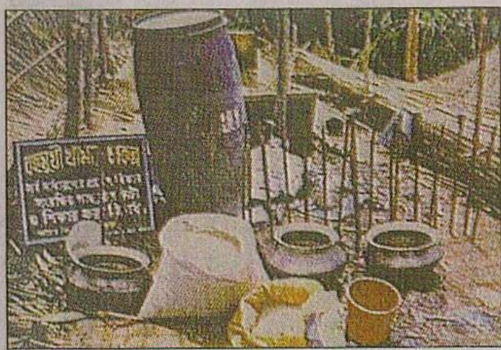
Abandoned equipment and signboard of a fake farm project, left, at a militant hideout in remote Mulatali area under Hathazari upazila in Chittagong; file photo of a militant training camp, right, in the Chittagong Hill Tracts.