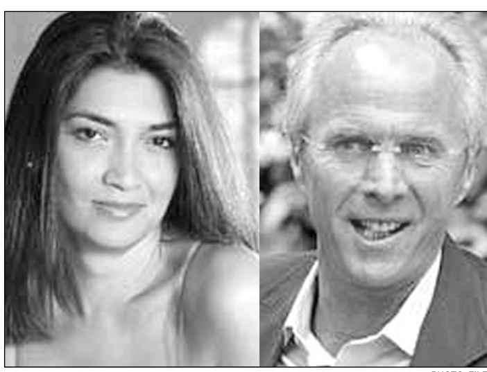
Faria Alam and Sven Goran Eriksson.

THE SUN, London England football manager Sven Goran Eriksson has been enjoying secret phone chats with ex-mistress Faria Alam in a bid to win her back, The Sun can reveal.