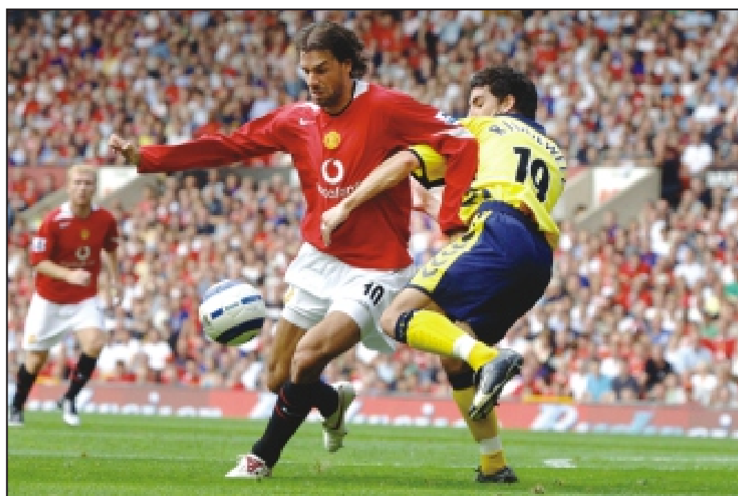
Manchester United's Ruud van Nistelrooy (L) vies for the ball with an Aston Villa player during their Premiership clash at Old Trafford on Saturday.

He added: "The way this series has brought in spectators, viewers and listeners, it gives me hope Test cricket is still not dead."