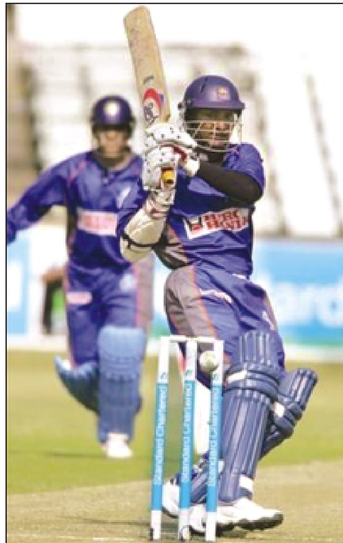
Asia XI's Kumar Sangakkara follows through on a glance during his knock of 61 against Africa XI in the Afro-Asia Cup at Kingsmead in Durban on Saturday.

The Asia XI, beaten by two runs in the first of three matches at Centurion Wednesday, bolstered their batting by selecting Jayawardene in place of Kumble.