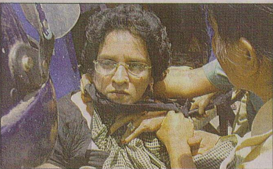
Police try to arrest a woman activist of the main opposition Awami League, left; and onslaught on a policewoman, right, by the activists of Jubo Mohila League during the hartal hours at Dhanmondi in the capital yesterday.