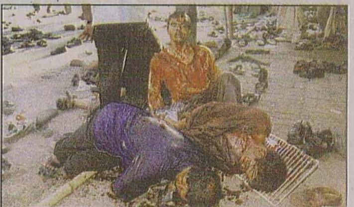
A scene of the massacre on the Bangabandhu Avenue during an Awami League rally on August 21 last year.