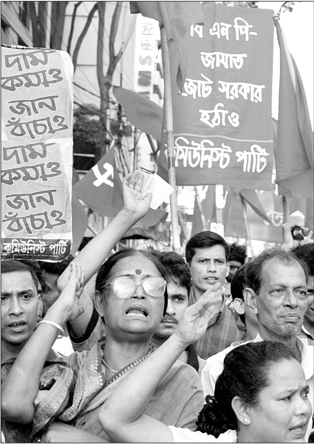
Communist Party of Bangladesh (CPB) took out a procession in the city yesterday protesting Wednesday's country-wide bomb blasts and in support of today's dawn to dusk hartal.