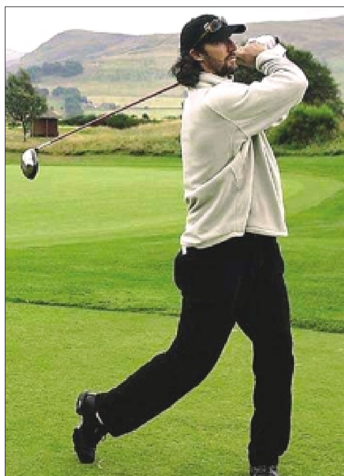
GETTING INTO DIFFERENT SWING: Australian fast bowler Jason Gillespie tees off at the Gleneagles Golf Course in Scotland on Wednesday.