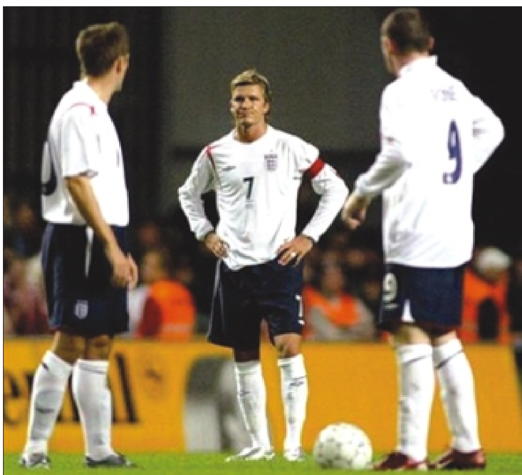
WHAT'S HAPPENING? England captain David Beckham (C) and teammates Michael Owen (L) and Wayne Rooney despondently look at each other after conceding yet another goal in the 4-1 loss to Denmark on Wednesday.