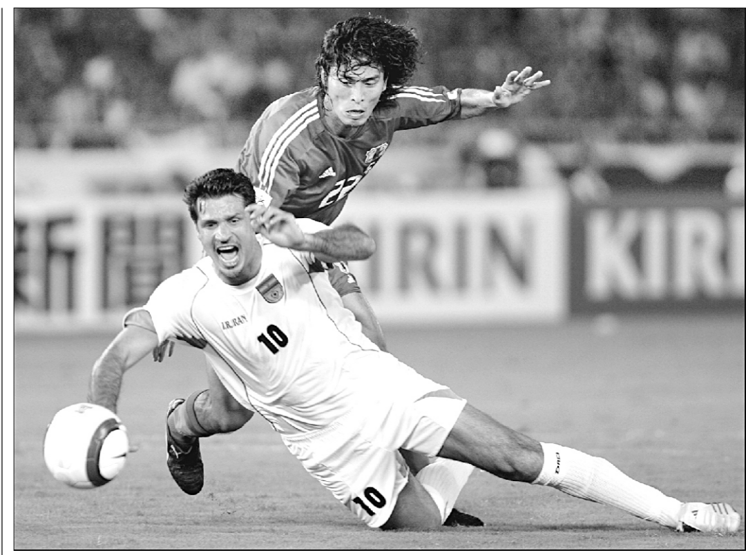
Veteran Iran striker and captain Ali Daei, (below) is taken down by Japanese defender Yuji Nakazawa at Yokohama stadium yesterday.

"Heavens, it might have been Steve Waugh out there, or Allan Border."