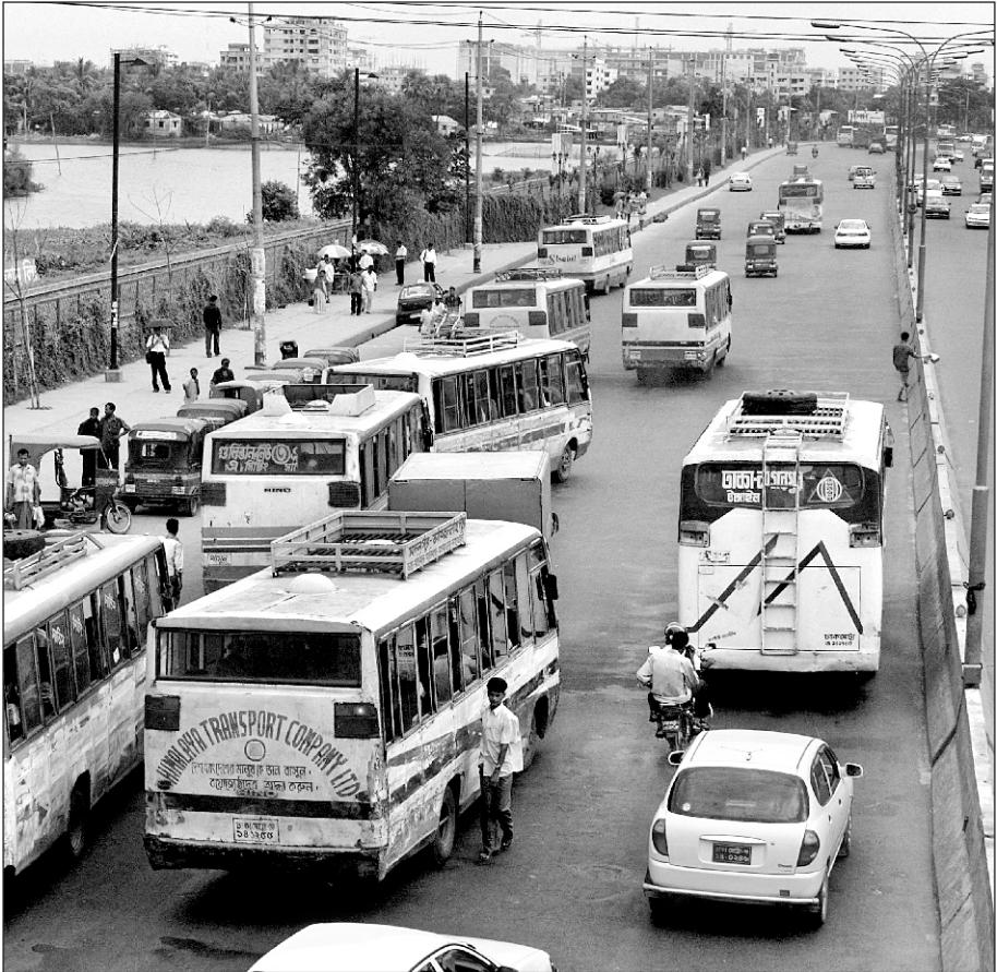
Newly constructed bus bays cannot ensure smooth flow of traffic as vehicles are parked indiscriminately on the airport road.

He said the budget of this fiscal year for buying books is Tk 89 lakh.